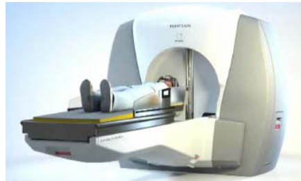
Gamma Knife Perfection

reduced residual dose to unintended areas. For more information, go to www.rwjuh.edu/gamma-knife and www.elekta.com . See Gamma Knife article, below.